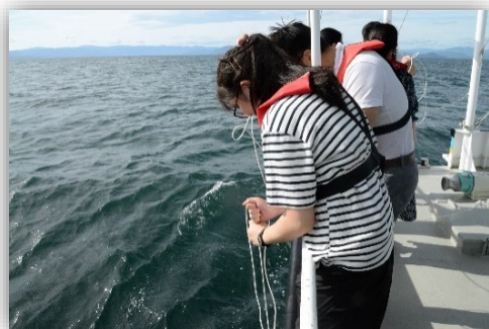
(Kyoto Summer Program 2019)

Off-campus activities designed to deepen understanding of Japanese and Kyoto culture, industry, and ecology. These will be provided online this year.