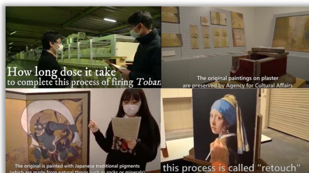
(Kyoto Spring Program 2021 (Online))